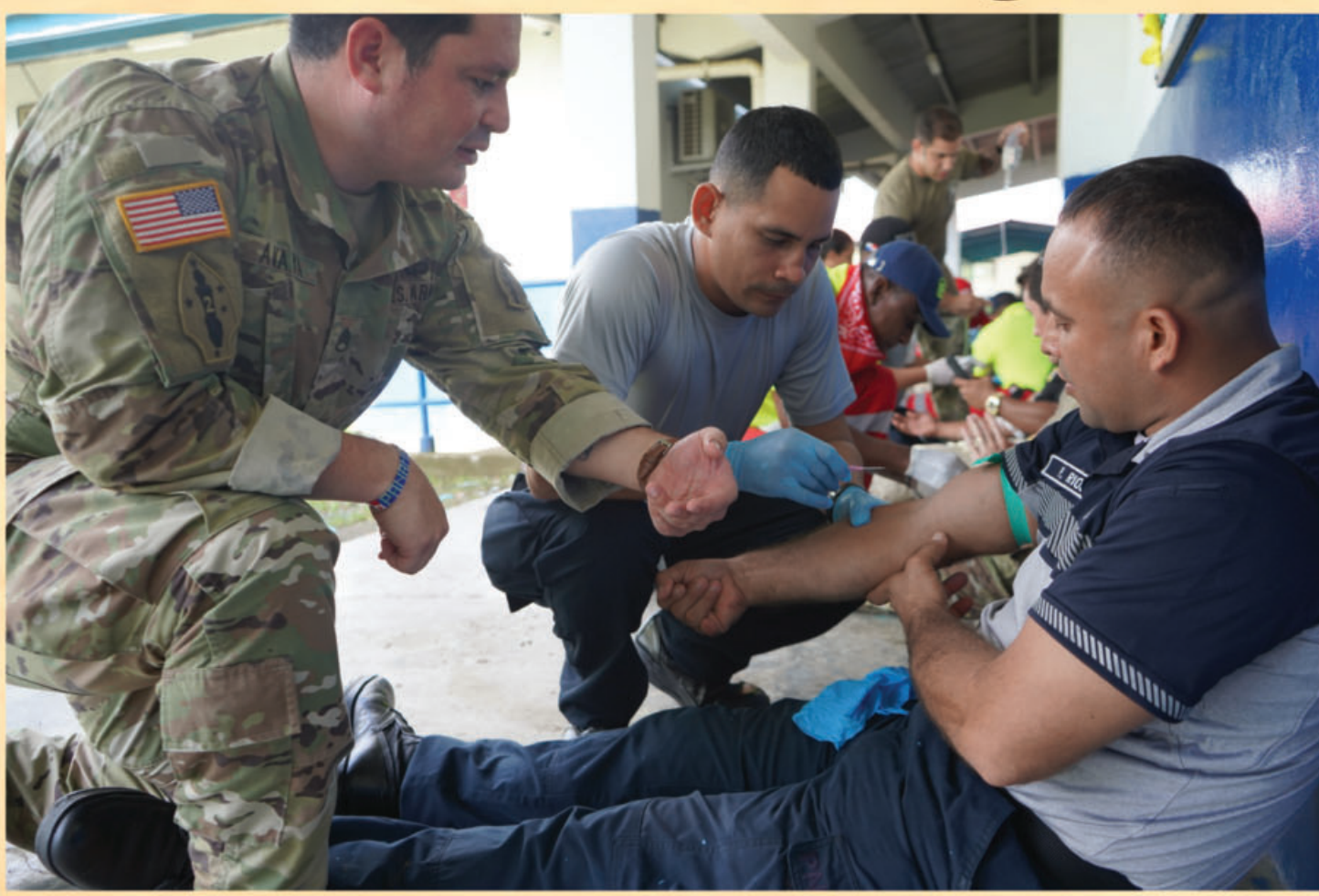
A Civil Affairs team member assigned to Special Operations Command South explains how to properly insert an IV during a first aid training in Provincia de Chiriquí, Panama, Aug. 30, 2019. The seminar is part of a series of civil affairs engagements focused on strengthening partnerships while enhancing readiness and cooperation among first responders, law enforcement and community leaders.