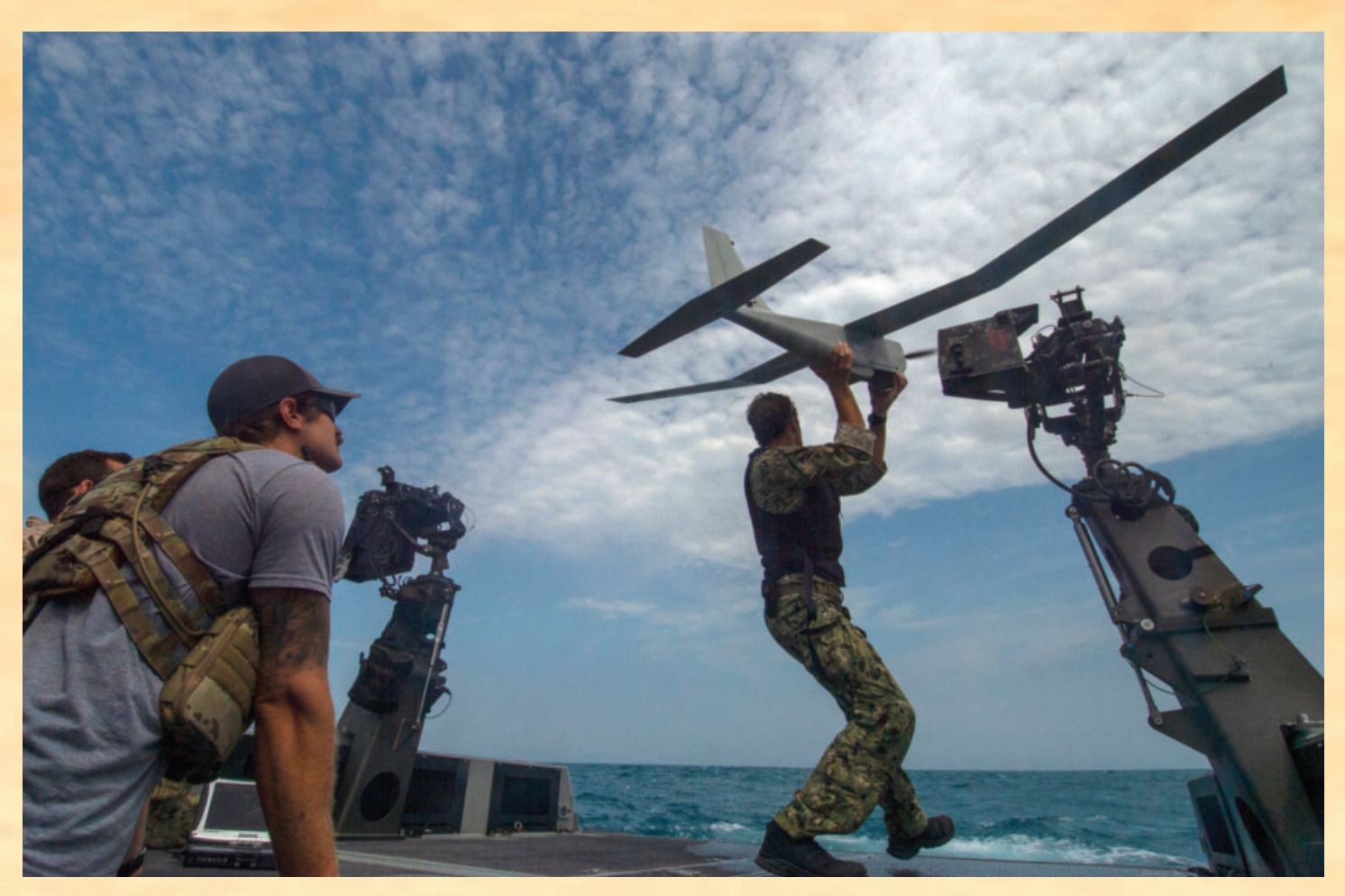
United States Navy Special Warfare Combatant-craft Crewmen from Naval Special Warfare launch an unmanned aerial system June 20, 2019 during a patrol on the Black Sea as part of Trojan Footprint 2019.

The fast rope insertion was just one of the many advanced tactical training events the multinational teams performed throughout the exercise. They participated in events including air assaults, military free fall operations, maritime insertions, and close quarters combat.