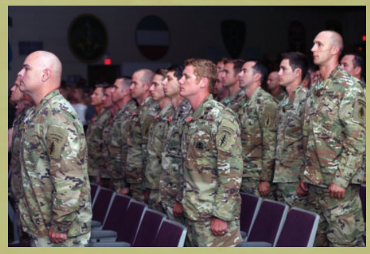
Green Berets of 10th Special Forces Group (Airborne) received awards for combat action in Afghanistan, during a valor award ceremony on Fort Carson, Colorado, Sept. 26, 2019.

Throughout the deployment, the task force produced unmatched effects against the Taliban, Islamic State of Iraq and Syria-Khorasan, Haqqani, and al-Qaeda, which