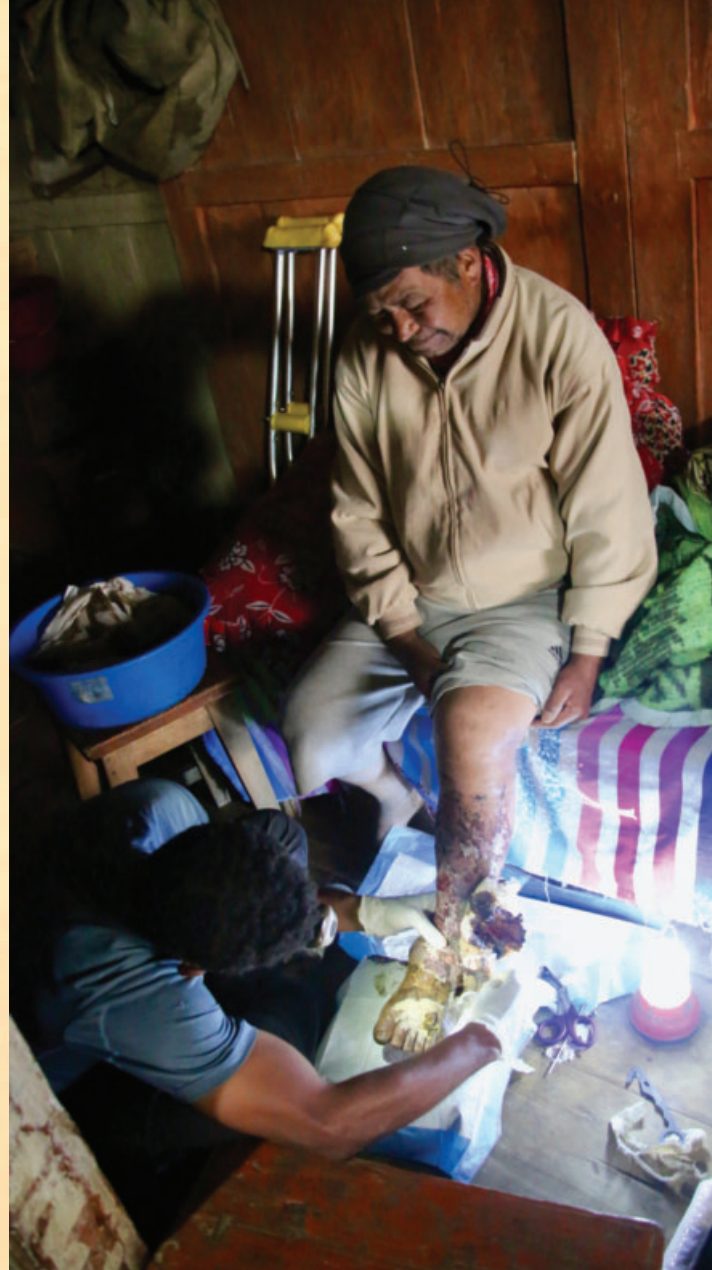
A Special Forces medic from 1st Battalion, 1st Special Forces Group (Airborne) examines a Nepali man's badly infected leg in Jomsom Valley, Nepal June 2018. The medic spent hours debriding the wounds and used honey as an antiseptic to treat and cure the wounds. Courtesy photo.

Eight months later, we returned to the same valley