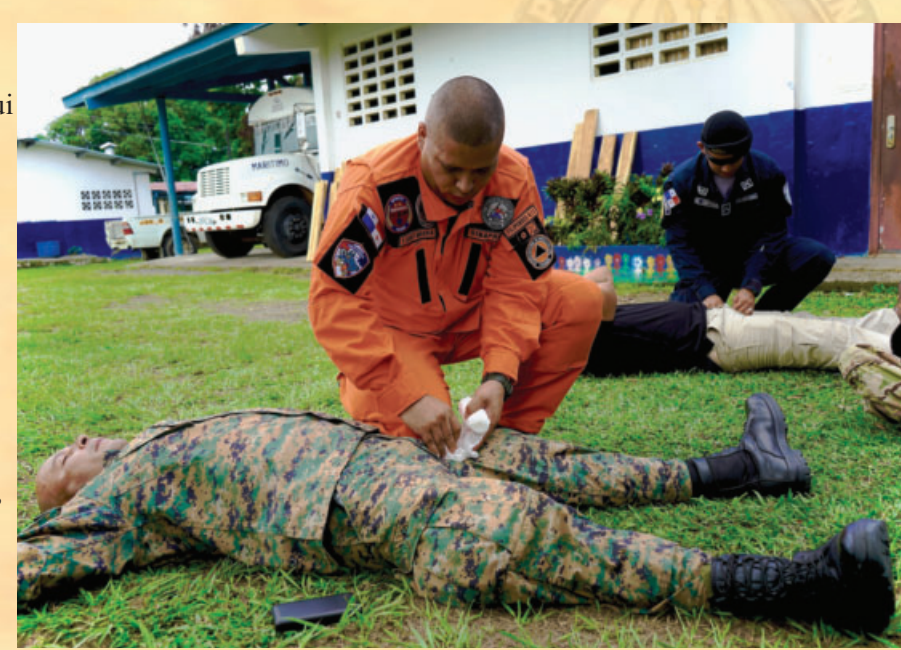
First responders and law enforcement personnel from Panamanian safety and security agencies practice first-aid techniques during a first-aid seminar in Provincia de Chiriquí, Panama. The seminar is part of a series of civil affairs engagements focused on strengthening partnerships while enhancing readiness and cooperation among first responders, law enforcement and community leaders.

"The training allows us to foster good relations with