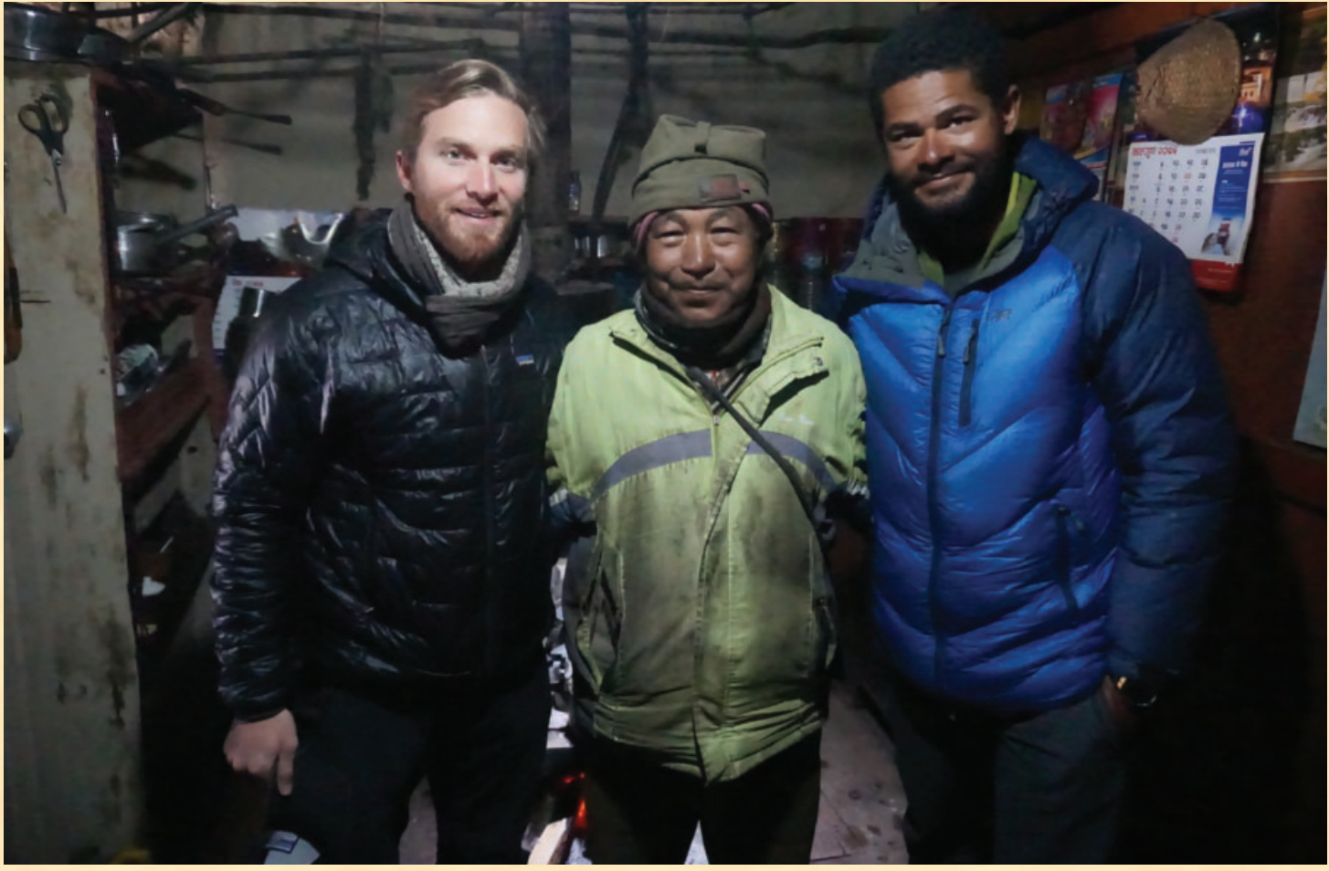
A detachment commander (left) and a Special Forces medic (right) from 1st Battalion, 1st Special Forces Group (Airborne) visit with a Nepali man eight months after treating him and found his leg had healed from their treatment in Jomsom Valley, Nepal February 2019.

(Left) A Special Forces medic from 1st Battalion, 1st Special Forces Group (Airborne) pours honey on a Nepali man's badly infected leg in Jomsom Valley, Nepal June 2018. The medic spent hours debriding the wounds and used honey as an antiseptic to treat and cure the wounds.