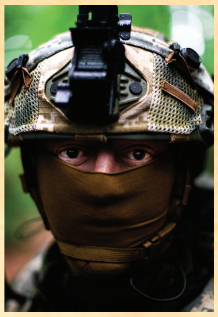
Ukrainian special operations forces acts as the opposing force Aug. 20, 2019 as part of Exercise Combined Resolve XII. Exercise Combined Resolve XII is a force-on-force exercise that included over 5,000 multinational participants, which took place in Hohenfels, Germany.

Macedonia, Ukraine, and the U.S. In addition to working with the conventional forces, they focused on core special operations missions such as surveillance and reconnaissance, direct action on targets, and coordinating operations between multiple small teams operating simultaneously.