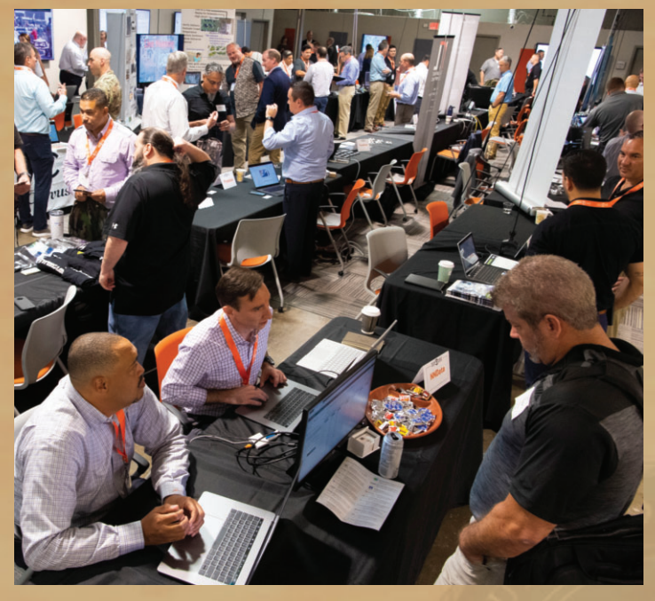
Fifty-four companies showcase their technologies to U.S. government attendees prior to the grand opening of the U.S. Special Operations Command Data Engineering Lab in Tampa, Fla., Sept. 25, 2019.

While the DEL and SOFWERX are co-located, the DEL will focus on AI, machine learning and data science; however, being in close proximity offers opportunities for both entities to collaborate on projects to further SOF capabilities.