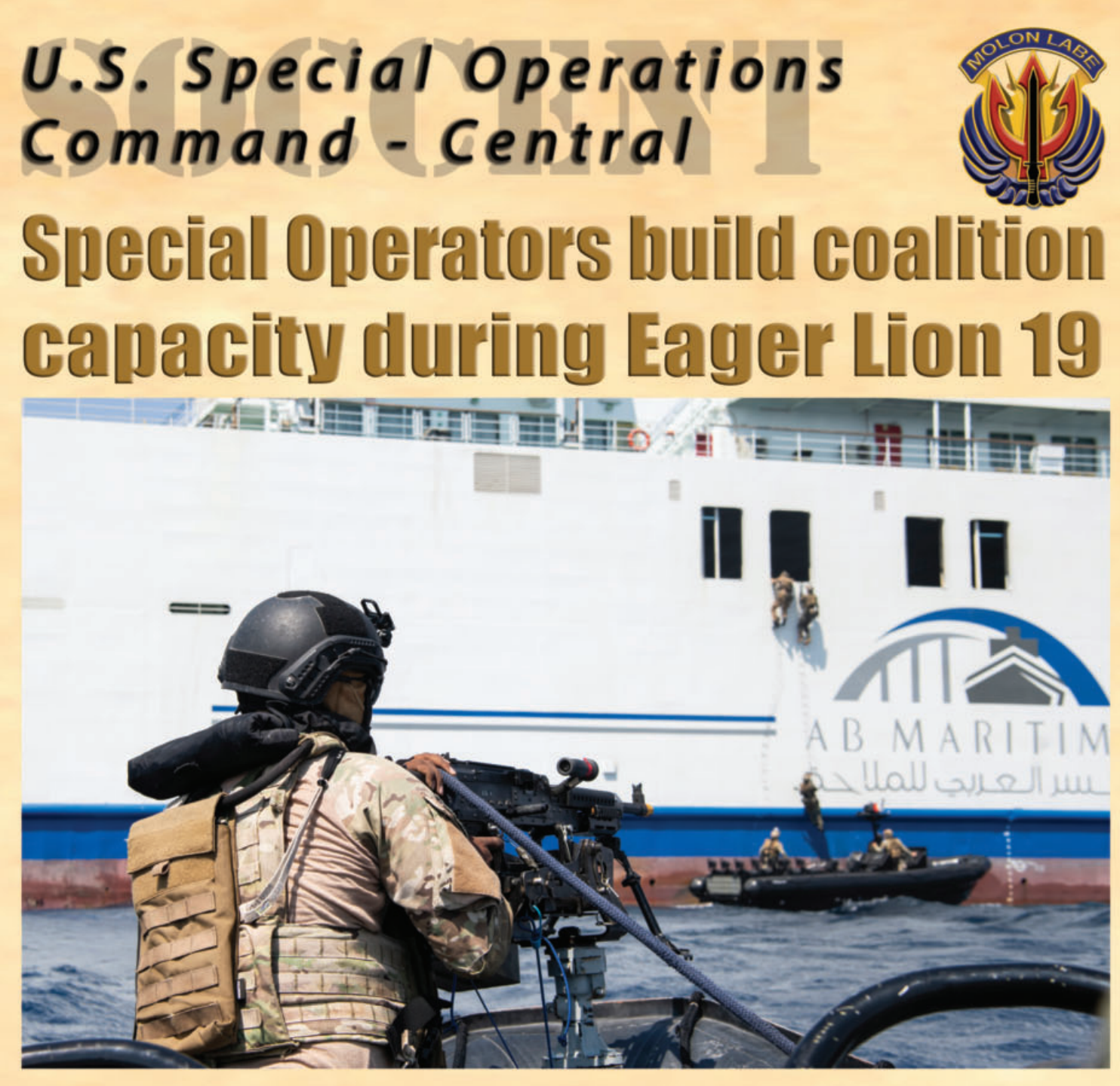
A Royal Jordanian special operations forces service member stands guard with an M240B machine gun as part of a naval visit, board, search, and seizure joint exercise during Eager Lion in the Hashemite Kingdom of Jordan, Sept. 4, 2019.