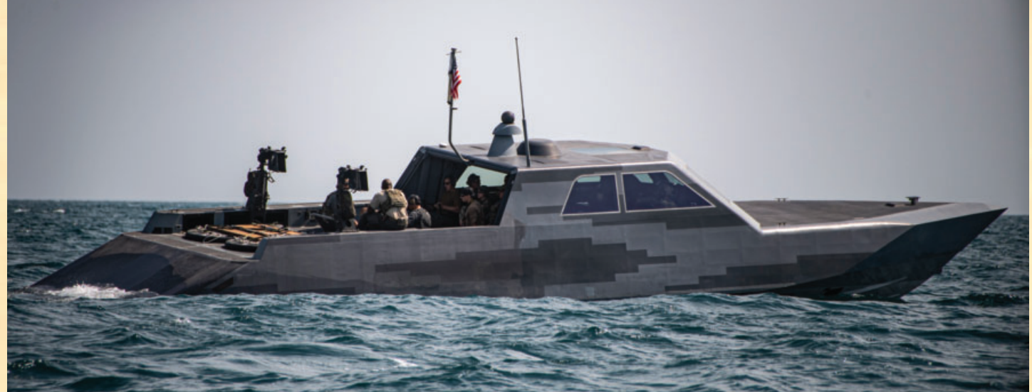
United States Navy Special Warfare Combatant-craft Crewman from Naval Special Warfare conduct a patrol June 20, 2019 on the Black Sea in coordination with Trojan Footprint 2019.

(Left) A U.S. Army Green Beret, assigned to 19th Special Forces Group (Airborne), participates in a night operation during Exercise Trojan Footprint 19, Ujdorogd, Hungary on June 15, 2019.