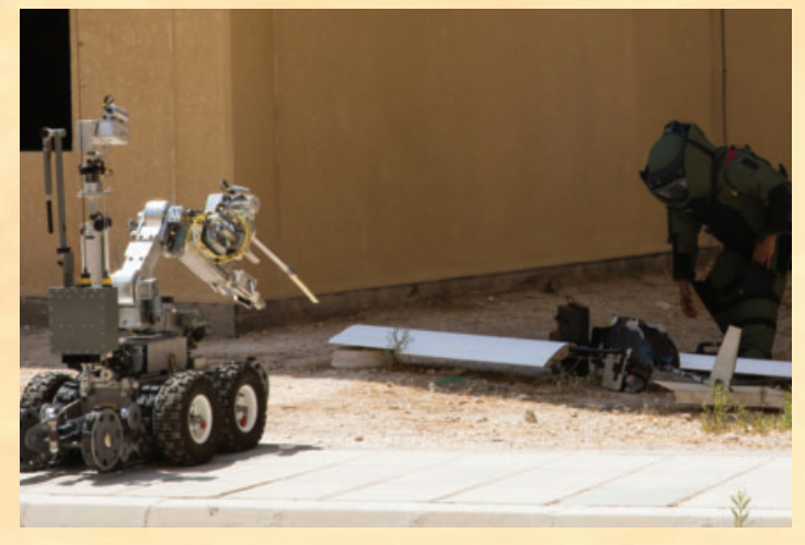
A Royal Jordanian Armed Forces explosive ordnance disposal technician uses an x-ray machine to search for explosives attached to a grounded unmanned aircraft system during exercise Eager Lion at the King Abdullah II Special Operations Training Center, Jordan, Sept. 2, 2019. Courtesy photo.

https://www.dvidshub.net/feature/EAGERLION19